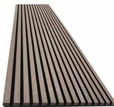
Grey Oak (veneer)

Mellow Timber Slats are available in a selection of 5 veneer finishes, all of which come as standard on a black polyester backing.