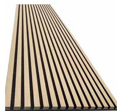
Light Oak (veneer)