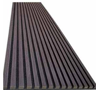
Charcoal Grey (veneer)