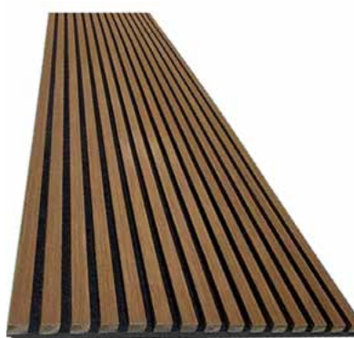
Smoked Oak (veneer)